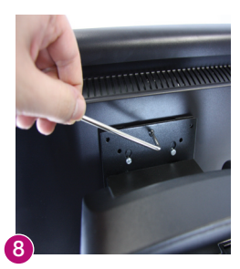
Lock the monitor to the UniStand using a single M4 6mm hex socket screw.